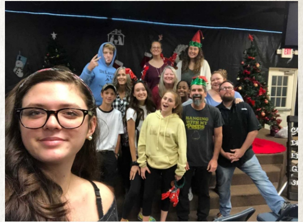
Assisted Living Facility Carolers during the church-wide caroling event this past December.

Sunday, December 9, featured one of the most popular services of the year: The Tree Decorating and Carol Service." Various tree decorations were given spiritual significance and carols were sung