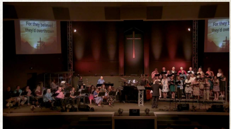
Easter Service 2018

Will you join God in what He is doing through Operation Christmas Child? Call me.