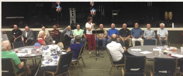
13 Men received "Quilts of Valor" for their Military Service