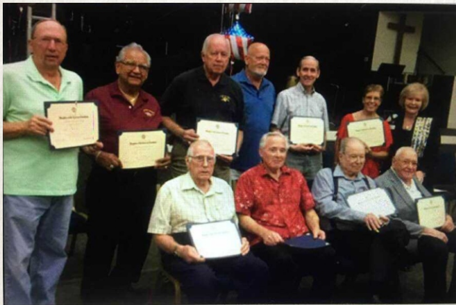
Vietnam Veterans honored by the Daughters of the American Revolution