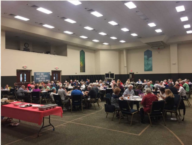
Good food and fellowship enjoyed by those in attendance to the March Adult Fellowship Luncheon