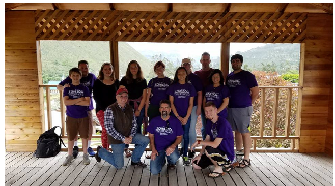
Our Ecuador 2017 Team!!!