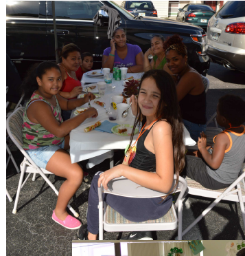
Provided traditional Thanksgiving Day meal.

Thank you EGFirst for supporting multi-housing ministry for low income residents in Melbourne.