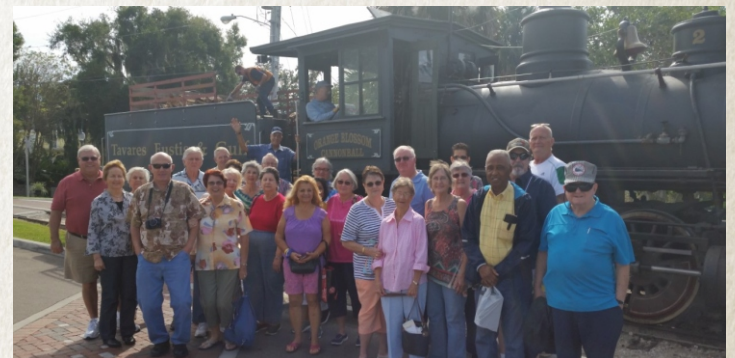
Adult Day Trips Happening Monthly

After last year's successful camp we will be putting on another fishing camp this summer! The camp for children ages 8-12. June 3 - 7: 9 AM to 3 PM at a cost of $80. Each day we will building our fishing abilities, as well as putting them to use in a new fishing location each day. Last year we caught tons of fish and had even more fun! If you are interested in enrolling your child or grandchild please email Patrick Lamb at Plamb@egfirst.org or call the church office and ask for Patrick Lamb.