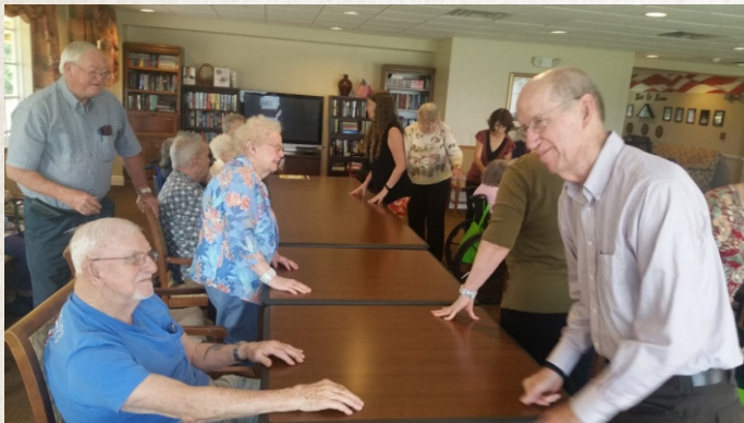
HEALTHCARE MINISTRY TEAM GREETES THE RESIDENTS OF GREENWOOD PLACE AFTER SHARING A PROGRAM OF FAMILIAR MUSIC AND CLASSIC GOSPEL SONGS

For the past 30 to 40 years EGFirst has been involved in a healthcare ministry to the Nursing Homes and Assisted Living Facilities in the area. Much of this time this ministry was known as the Young-at-Heart Band. In more recent times the group has become known as the Healthcare Facility Ministry team.