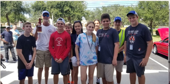
Youth at the Fall Car and Craft Show

The Reign study directly confronts what many leaders believe is the primary shortfall of teenagers in the church today—a me-centered faith some call Moral Therapeutic Deism. Church teenagers do love Jesus, but they tend to see Him as a nice friend or even a mascot. They keep Him in the background of their lives, with one exception. When they face some problem or obstacle, they fully expect Him to show up and poof their troubles away. He is relevant only when He is making their lives happier and problem free.